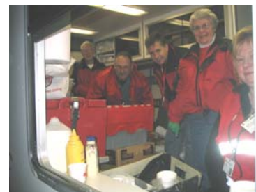
DAT Team on ERV

Hempstead Fire 1/20/05 - ARES members responded to a fire on Jackson St. in a Hempstead Apartment building on Thursday, January 20, 2005. A fire, which started in the furnace room, caused the evacuation of 100 units. ARES members supported the American Red Cross in Nassau County at the Reception Center that was set up down the block from the scene of the fire, at Chapter Headquarters in Mineola, and later in the day at the Shelter, which was established along with communications for the ERV that continued to support the scene with hot meals and soup.